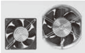
attached to a cooling fan